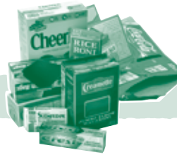
Boxboard crackers, cereal, pasta, toothpaste, etc. (pop and beer boxes, too!)