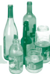
Glass Bottles & Jars rinse clean, remove lids