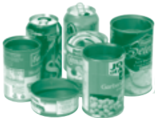
Steel & Aluminum Cans, Foil & Trays rinse clean, labels are OK