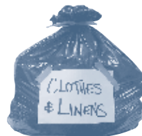
Put in a sturdy plastic bag. Fasten tightly. Clearly label bag CLOTHES & LINENS.