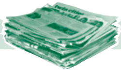
Newspaper with inserts