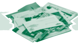
Magazines, Mail, Phonebooks & Office Paper please put shredded paper in a closed bag