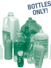
Plastic Bottles with a ♻️ or ♻️ rinse clean, remove lids, flatten