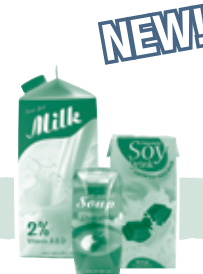
Milk Cartons & Juice Boxes including soy milk, soup, & broth cartons remove caps, rinse clean, flatten